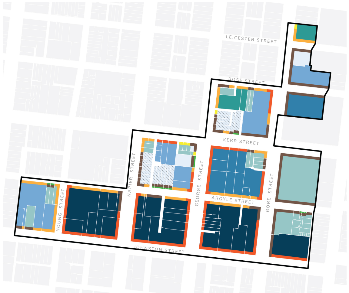
Map 1: Building and street wall heights