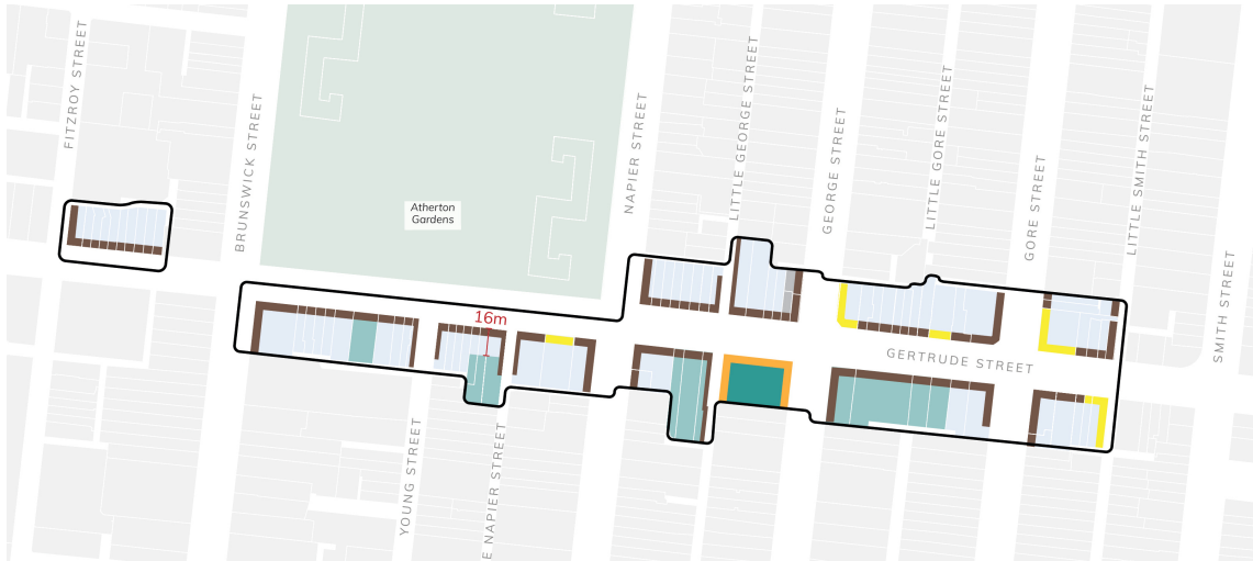
Map 1: Building and street wall heights