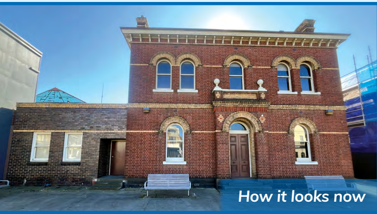
How it looks now