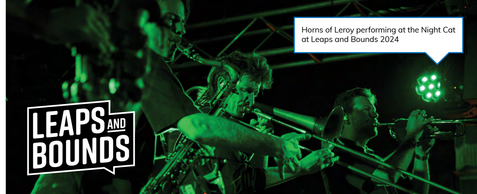
Horns of Leroy performing at the Night Cat at Leaps and Bounds 2024

Be sure to explore our dedicated collection of works by Aboriginal and Torres Strait Islander artists, writers and creatives at each of our five library branches.