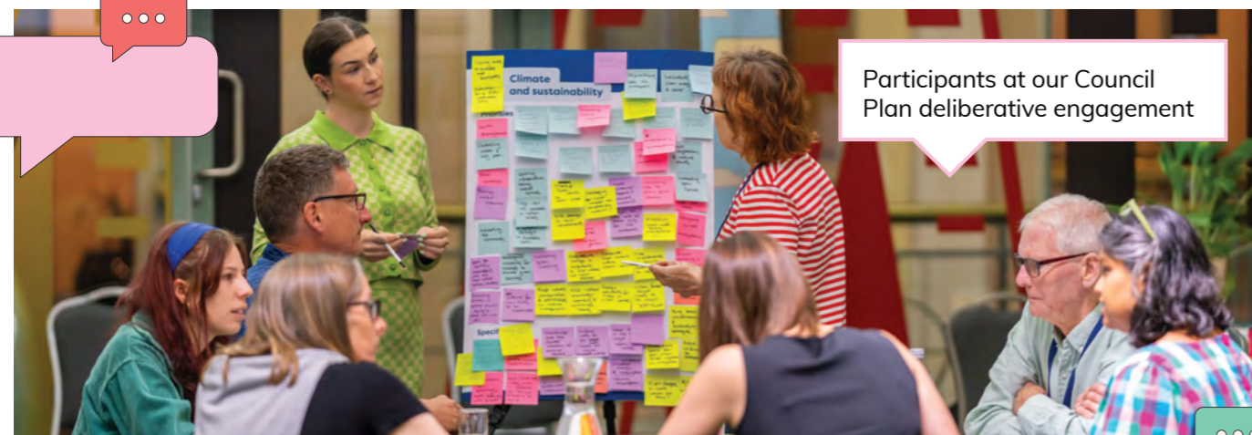
Participants at our Council Plan deliberative engagement

Our draft Budget continues to support essential services like waste and recycling; parks; roads; sports facilities; and open space improvements, to meet current needs and to plan for future growth.