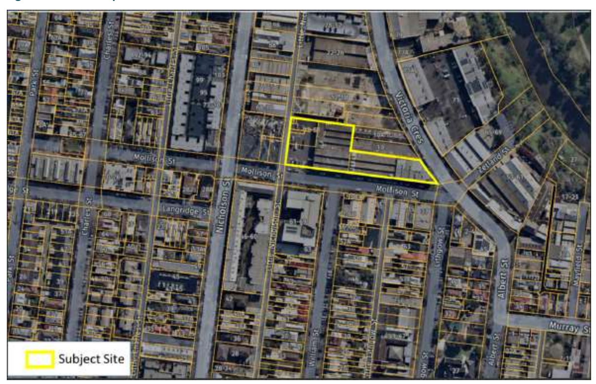
Figure 2 Aerial photo of site