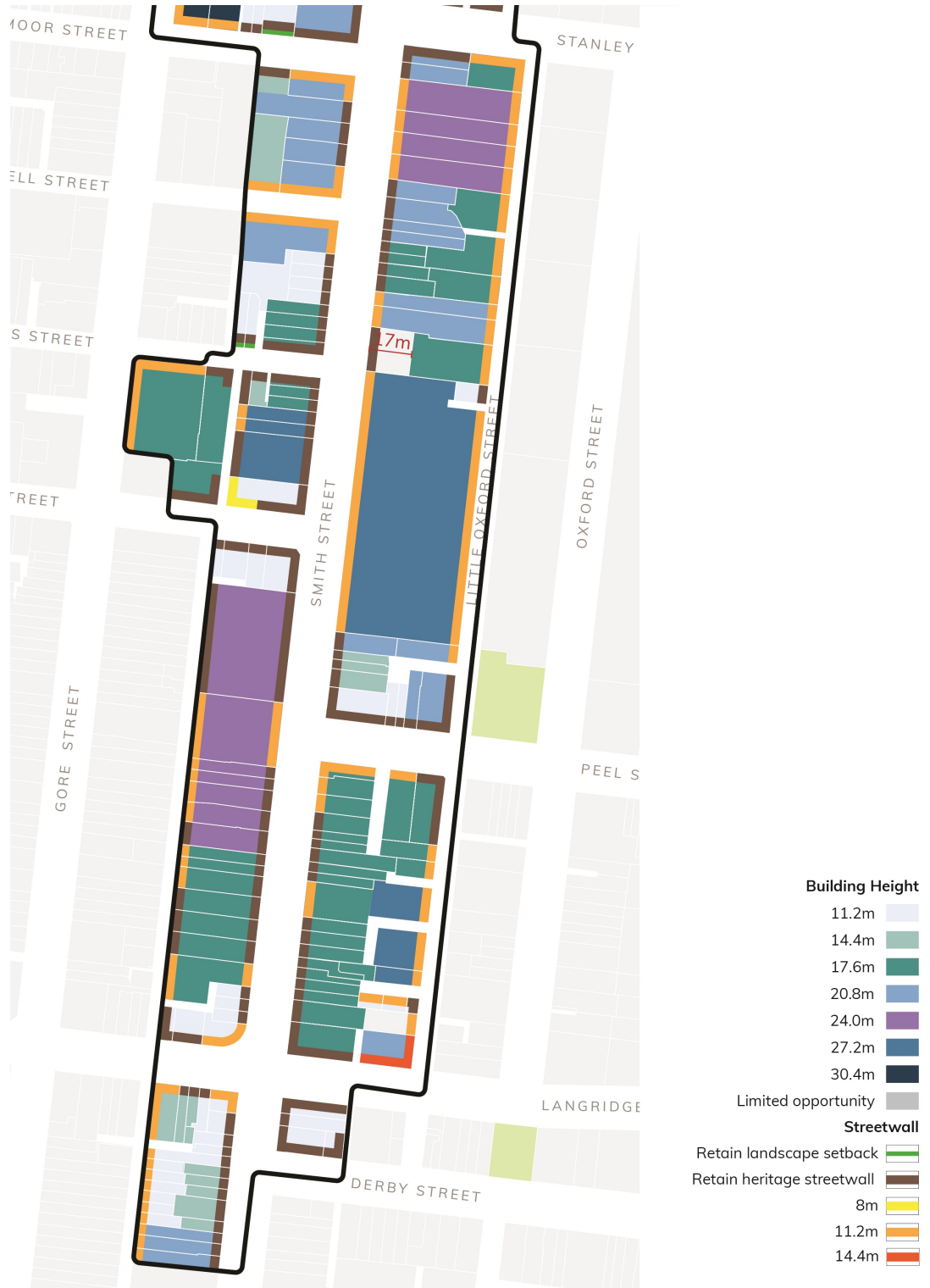
Map 2: Street Wall and Building Heights South of Stanley and Moor Streets