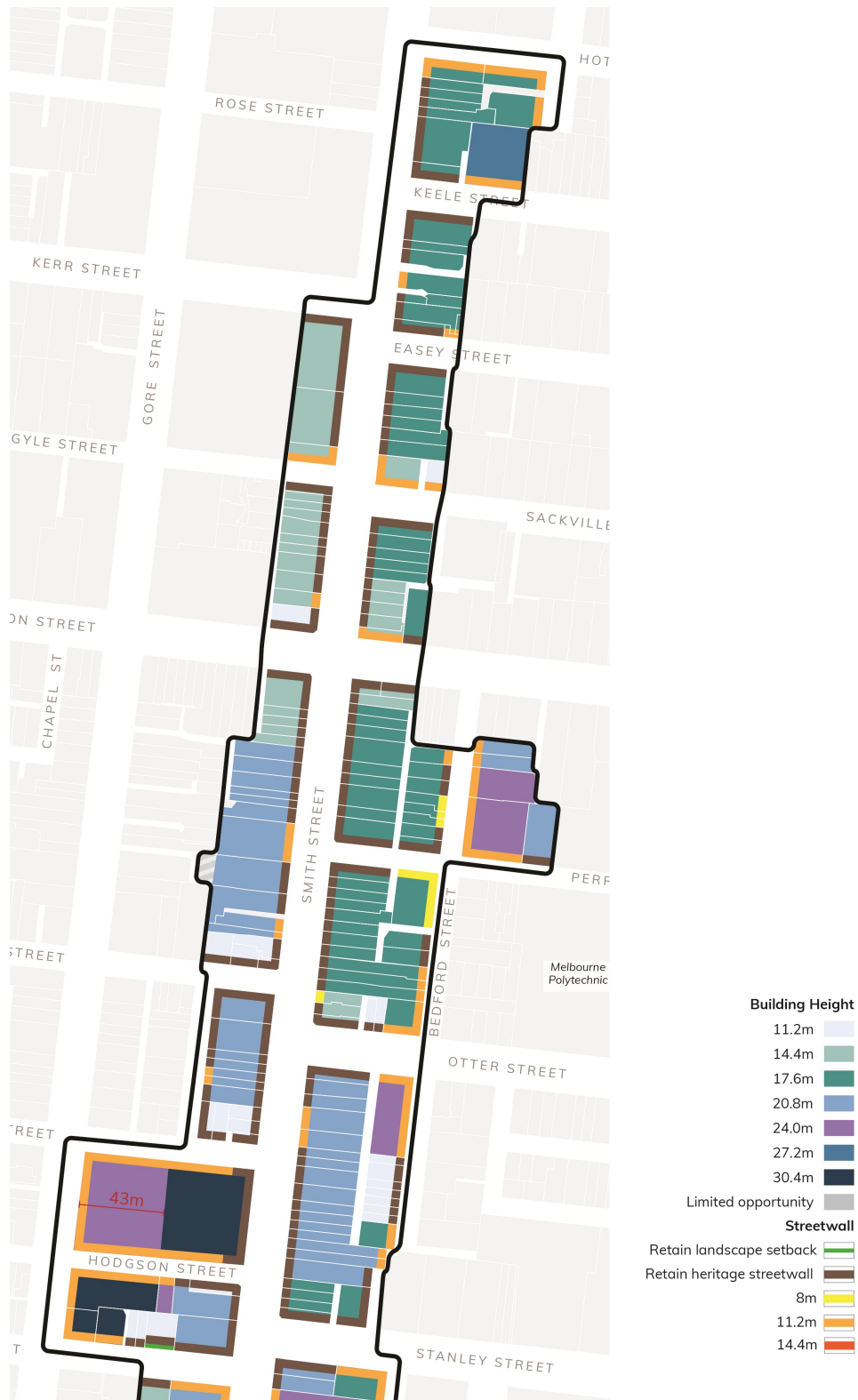
Map 1: Street Wall and Building Heights North of Stanley and Moor Streets