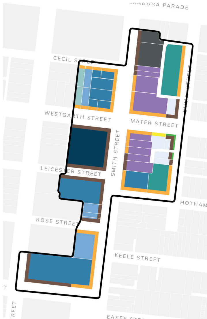
Map 1: Street Wall and Building Heights North of Kerr and Hotham Streets