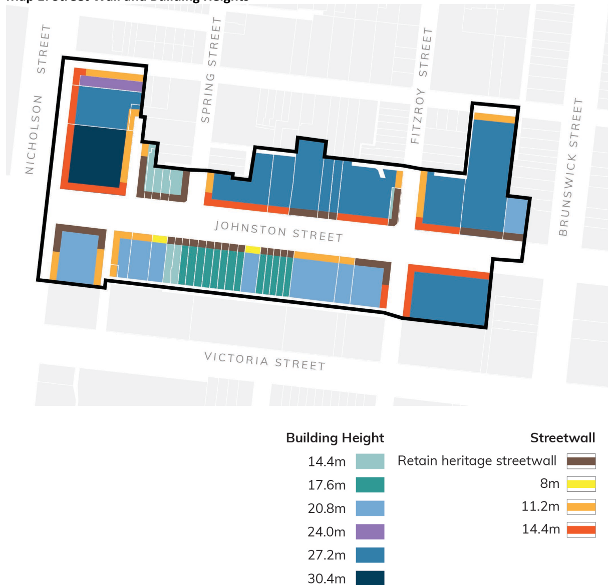
Map 1: Street Wall and Building Heights