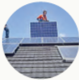
YEF reached a milestone of 2 megawatts of installed solar through our programs

Towards the end of the 2018 calendar year YEF worked towards finalising project plans of the Low Income Retrofit project as well as a City of Yarra Solar bulk buy. The concept of a combined project titled "Comfortable Homes Yarra" was explored.