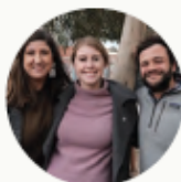
YEF supports North Carlton Primary in a Yarra Sustainability Grant submission

A further opportunity for community engagement in this period was possible in assisting North Carlton Primary in a submission for funding for composting bins through the Yarra Sustainability Grants. YEF agreed to act as an auspice if the school is successful. Additionally, YEF began organising LED replacement quotes for North Carlton Primary utilising VEECs where possible.