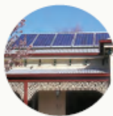
YEF plans Yarra Solar Bulk Buy in partnership with Yarra City Council

YEF began the financial year's residential work by finalising project plans to roll out our Yarra Solar Bulk Buy Program. Funding for this flagship project was made possible from income generated from projects outside of Yarra, such as regional solar bulk buys.