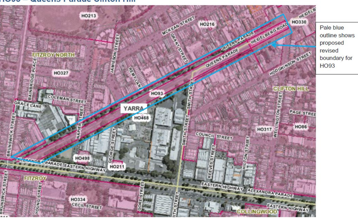
HO93 - Queens Parade Clifton Hill