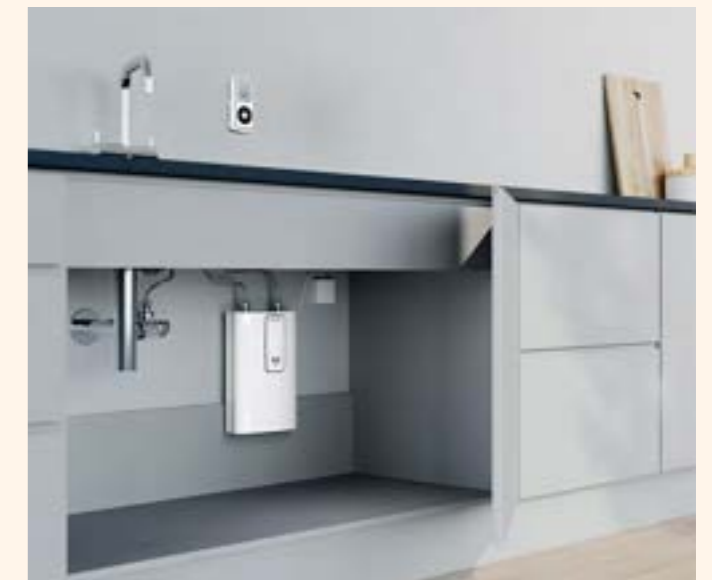
Electric Instantaneous DHW Unit.