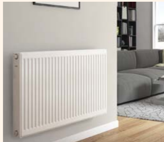
Image: Wall mounted hydronic heating panel.