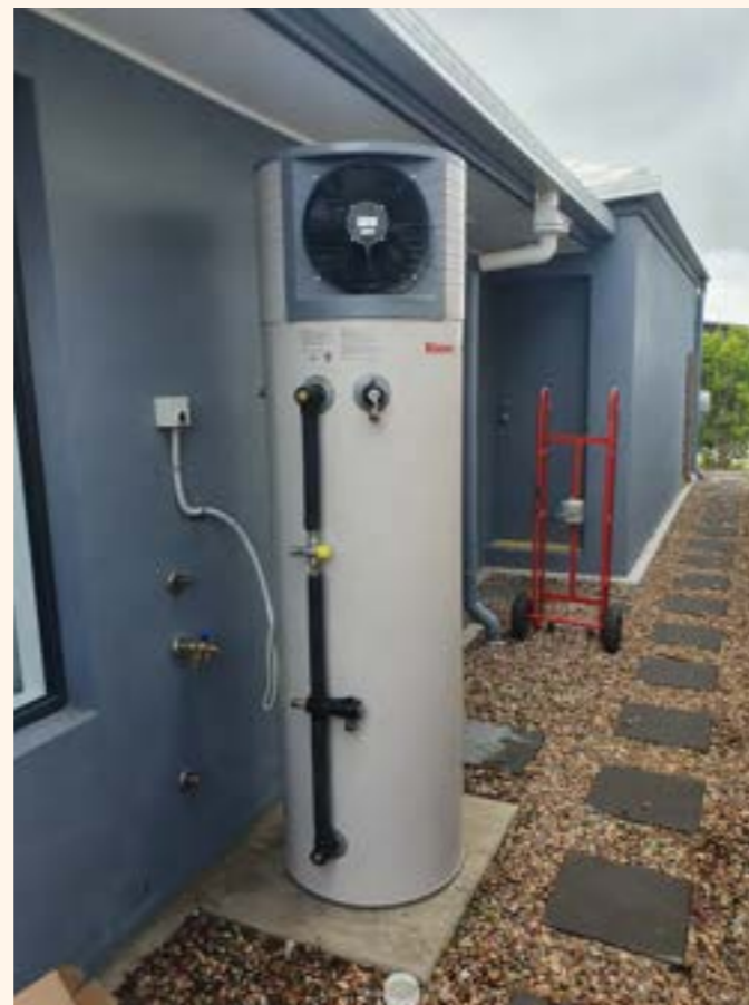
Freestanding integrated DHW Heat Pump Unit ©