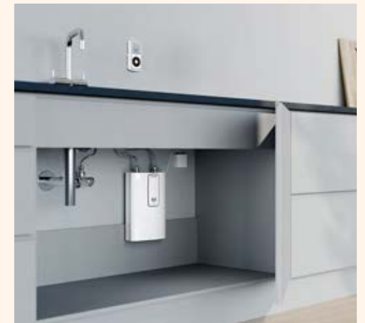
Electric Instantaneous DHW Unit.

Saving per unit per year when compared to an electric storage unit