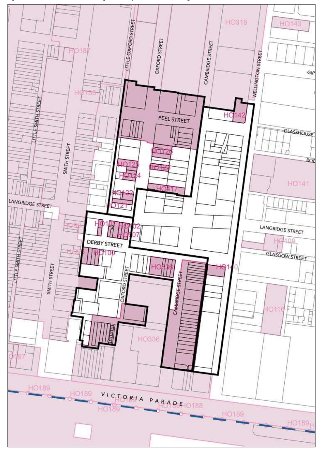
Figure 2 Location of Heritage Overlays within the Collingwood South Mixed Use Precinct