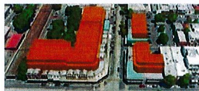
Figure 2: 3D Visualisation of Swan Street Richmond looking west from Church Street showing chopped off buildings. Note that it is unlikely any of these roofs will survive.