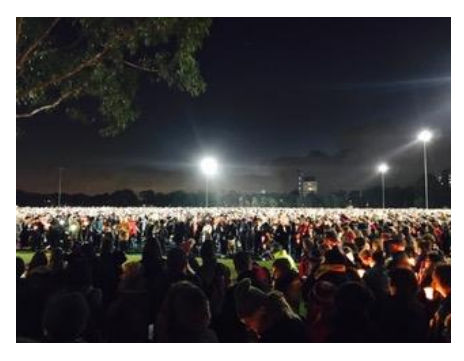
Similar vigils in parks across Melbourne

The Princes Hill Community have offered support to the family and a condolence book is available at the North Carlton Railway Station Neighbourhood House for people to express their grief and support to Eurydice's family. Members of the Railway House are also compiling a collection of tributes to Eurydice from the Princes Hill neighbourhood.