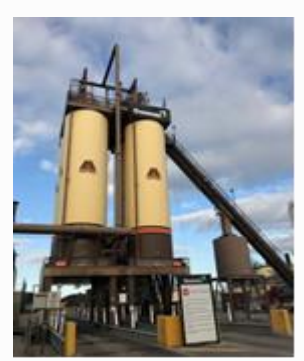
Recycled plastic park furniture Princes Park (left); Downer Somerton asphalt works (centre, right) using mix of asphalt, crushed glass (5-15%), plastics (0.7-1%), tyres (0.5%), toner (0.5%) for road making