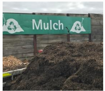
Treated organic waste - to soil