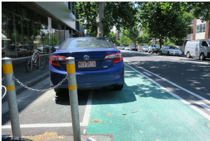
The bay functions poorly as a car bay

The car bay adjacent to the bike parking is already difficult for parking a car in. Cars frequently obstruct the bike lane. There is generous car parking within The Hive building, this on street bay is not required.