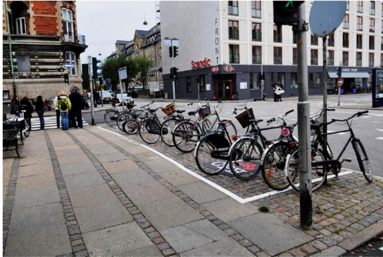
General bicycle parking – note no hoops