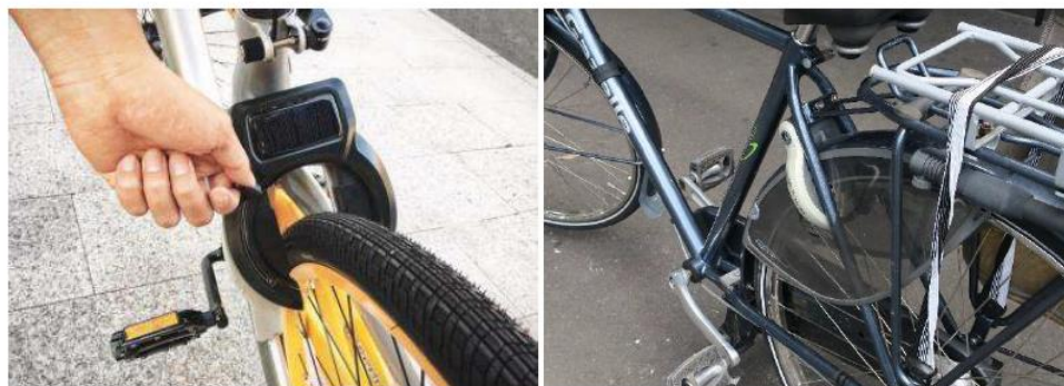
Share bike, and private bike with wheel lock (no hoops required)