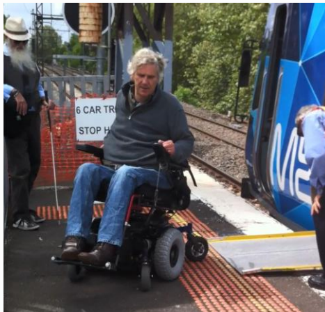
Collingwood Railway Station, Platform 1

The Disability Advisory Committee is recommending that Council endorse this report; forward it to Public Transport Victoria, Metro Trains and other relevant organisations; and engage in consultations with the relevant authorities advocating for upgrades to Yarra's railway stations as outlined in the report.