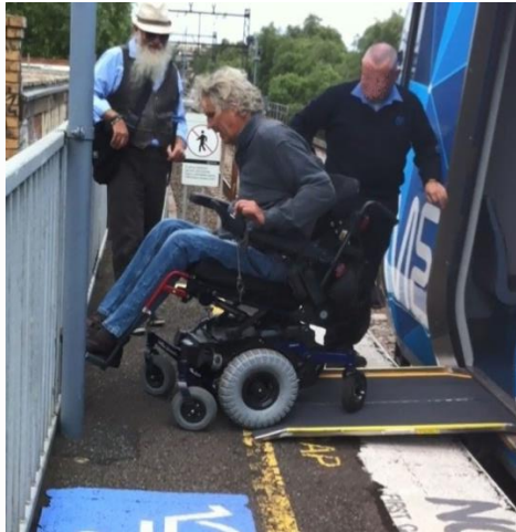
North Richmond Railway Station, Platform 1