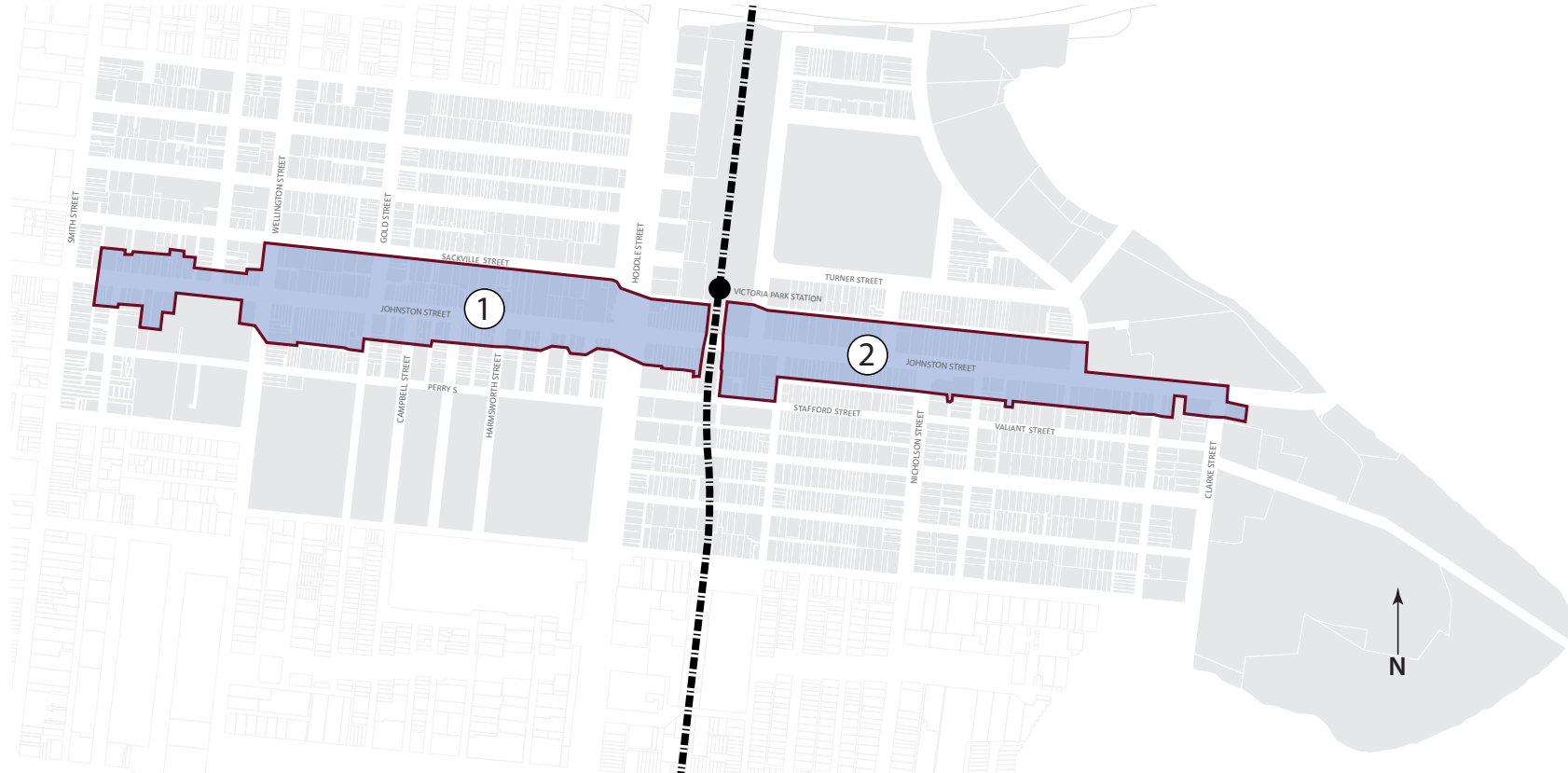
Map 1: Johnston Street Local Area Plan (Precincts 1 and 2)