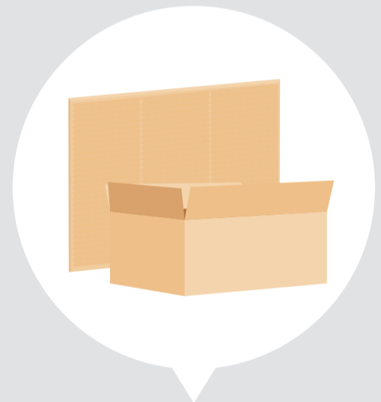
Clean flattened cardboard