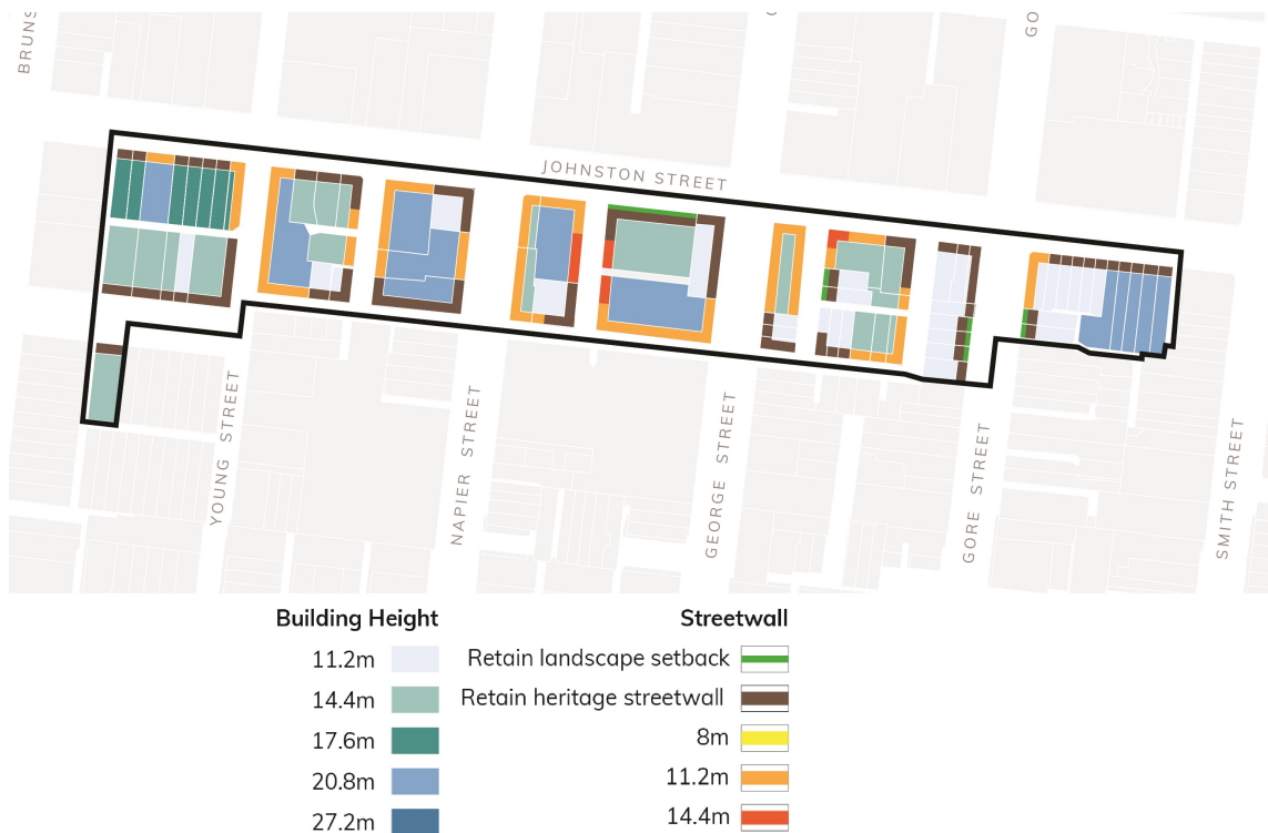
Map 1: Street Wall and Building Heights Johnston Street South and Chapel Street