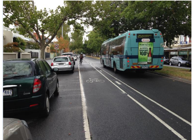
Rathdowne Street, North Carlton