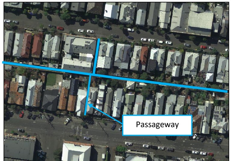
Passageway (below left) that forms part of a link between two roads (see aerial below right) that provides a public access connection