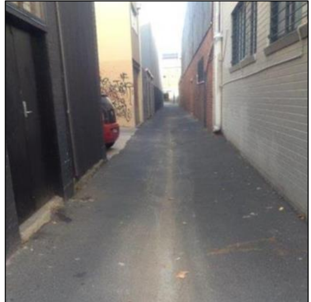
Laneways (above left and right) that connect two roads and provides a public access connection