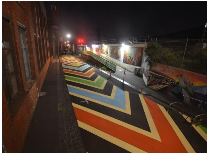
Stewart Street, Richmond