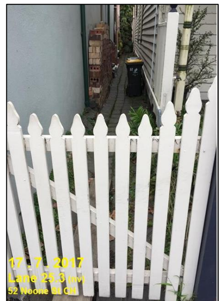
A laneway (above left) and passageway (above right) that have been gated and incorporated into private property