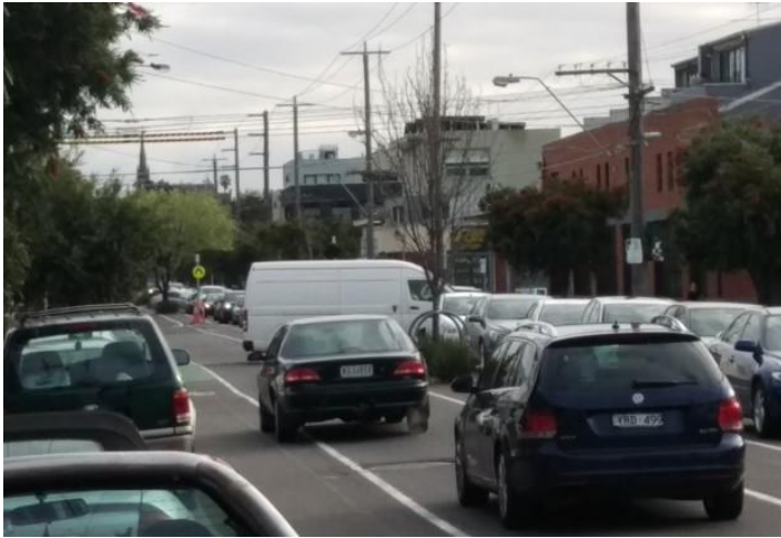
Wellington Street, Collingwood