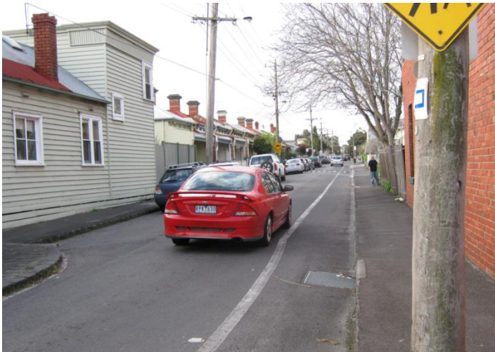
Yambla Street, Clifton Hill