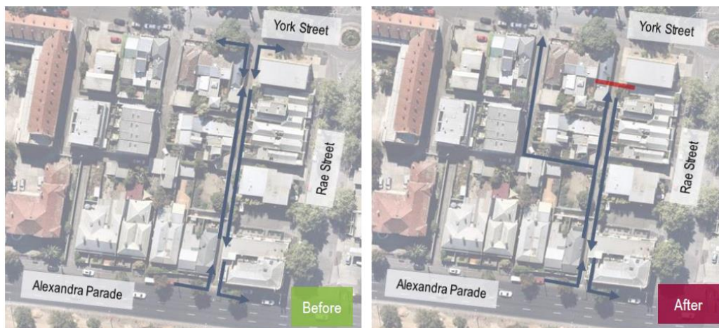
Figure 1 Proposed changes to unnamed laneway west of Rae Street as per GTA Traffic Impact Assessment V171550

The LAPM was adopted in March 2019 and aims to create a more livable area for the community through a placemaking approach. A traffic impact assessment report has been prepared by GTA consultants on behalf of the City of Yarra (Fileit reference 17958977).