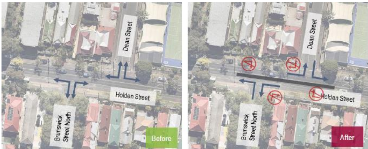
Figure 1 Proposed changes to Holden Street at Brunswick Street North and Dean Street as per GTA Traffic Impact Assessment V171550

The LAPM was adopted in March 2019 and aims to create a more livable area for the community through a placemaking approach. A traffic impact assessment report has been prepared by GTA consultants on behalf of the City of Yarra (Fileit reference 17958977).