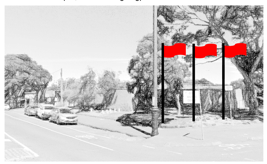
At Collingwood Town Hall, the following flagpoles shall be used:

At Clifton Hill Depot, the following flagpoles shall be used: