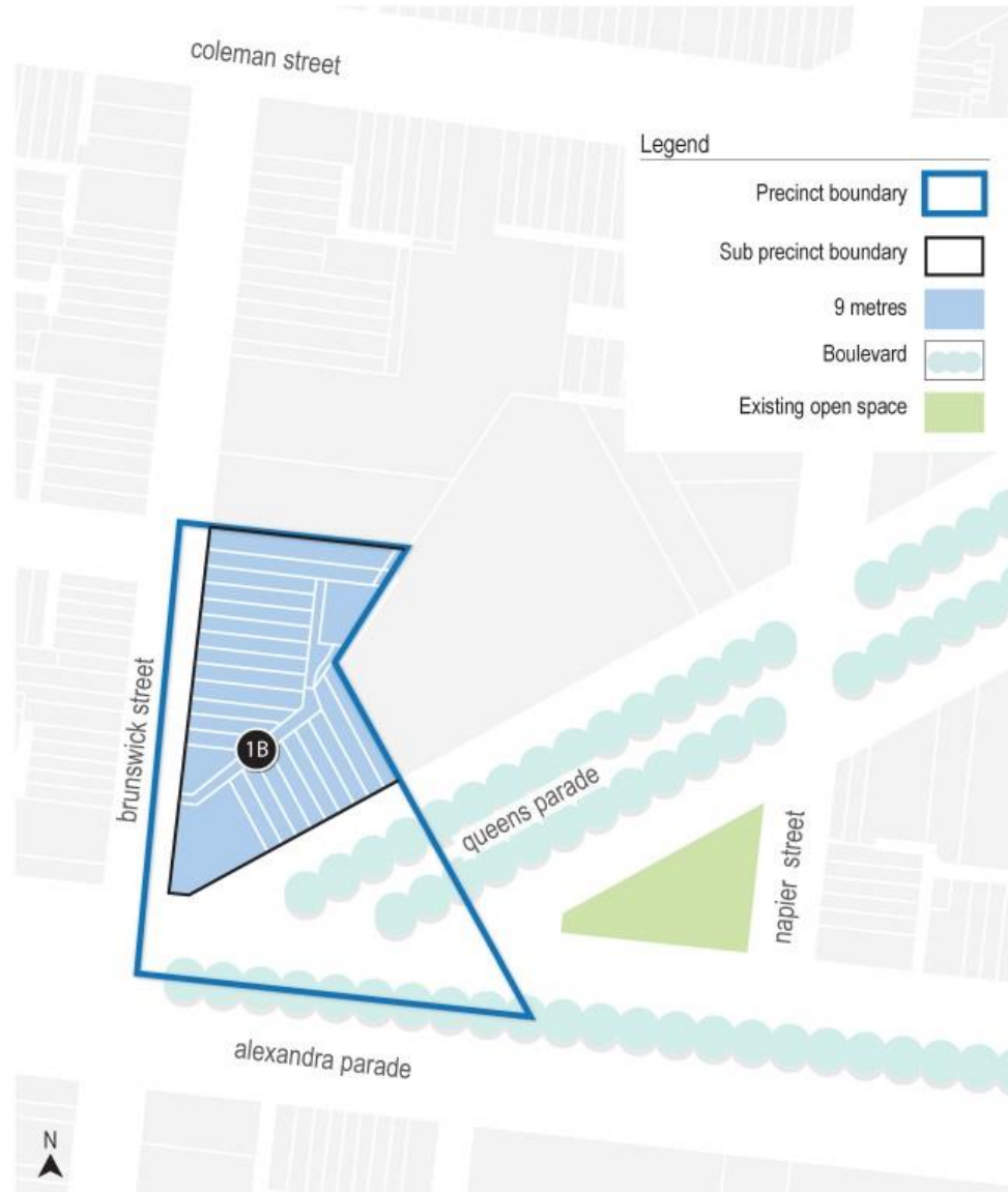
Map of Precinct 1