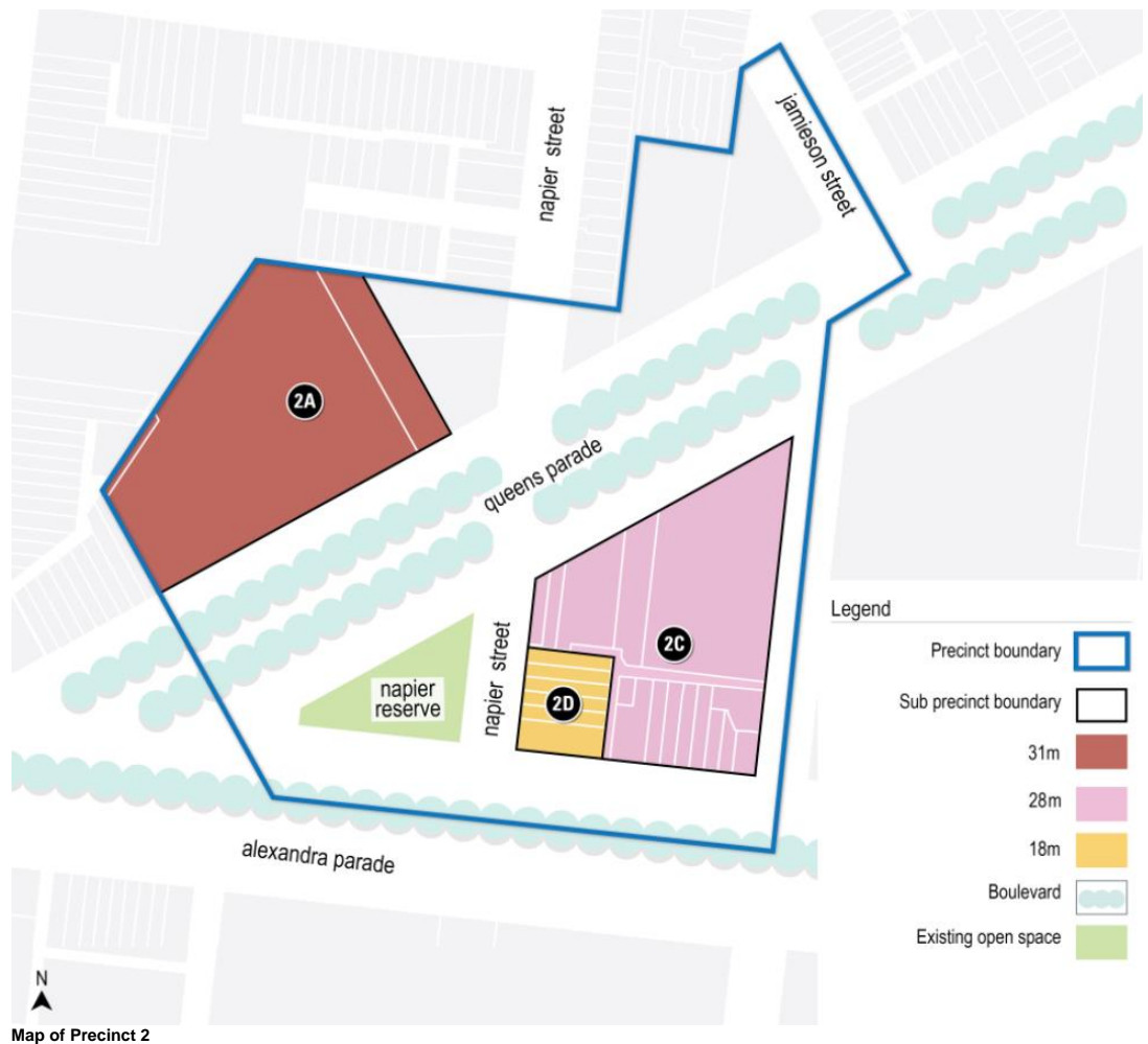
Table 2 – Street wall height, building height and setbacks for Precincts 2A, 2C and 2D