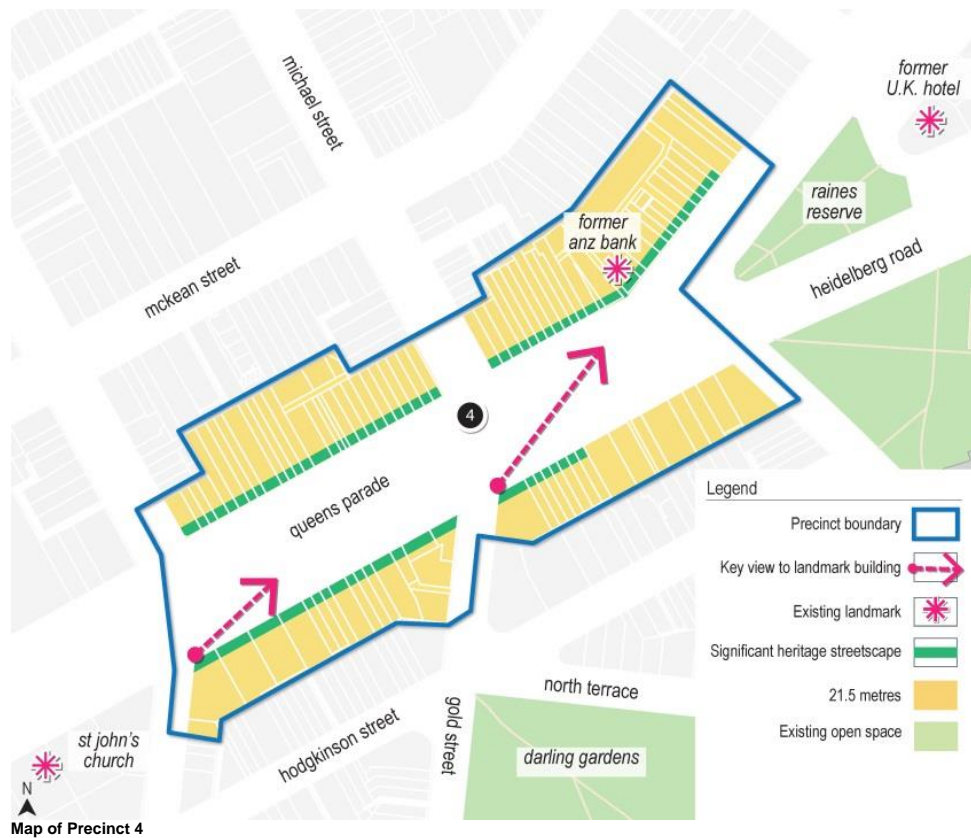
Table 4 – Street wall height, building height and setbacks for Precinct 4