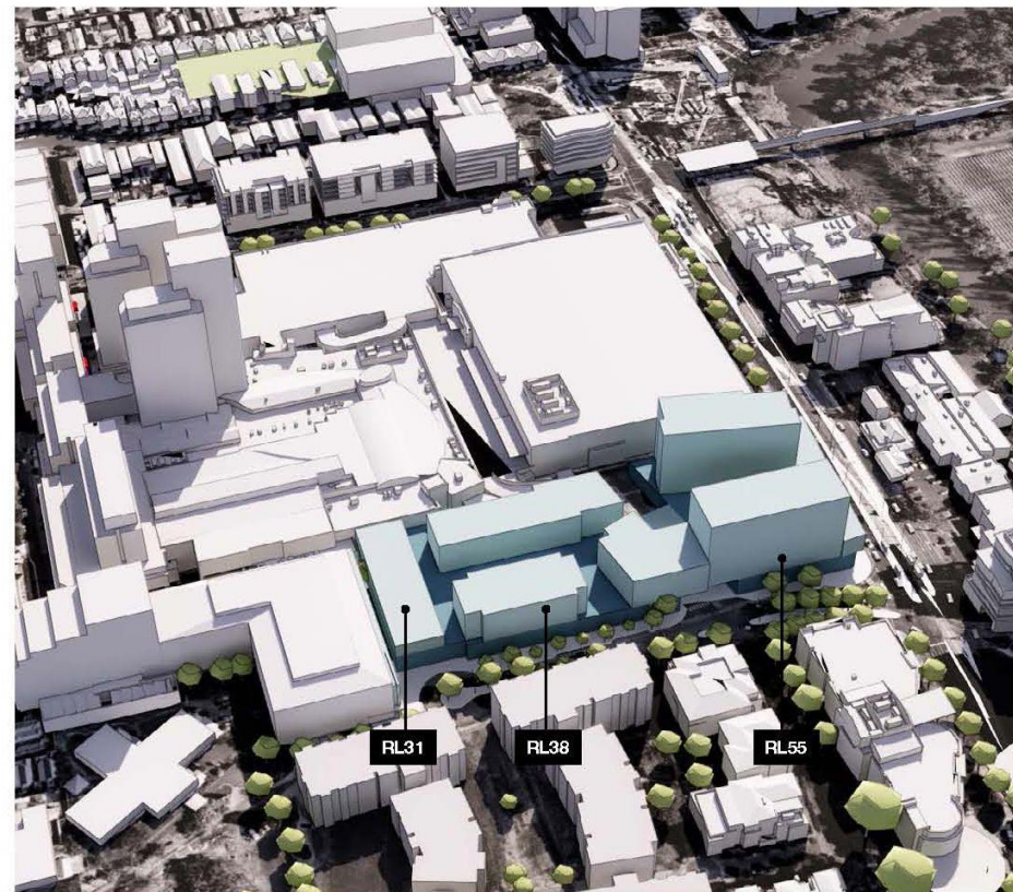
Figure 1: Masterplan of the River Precinct Lots 9 and 10 (proposed and approved)