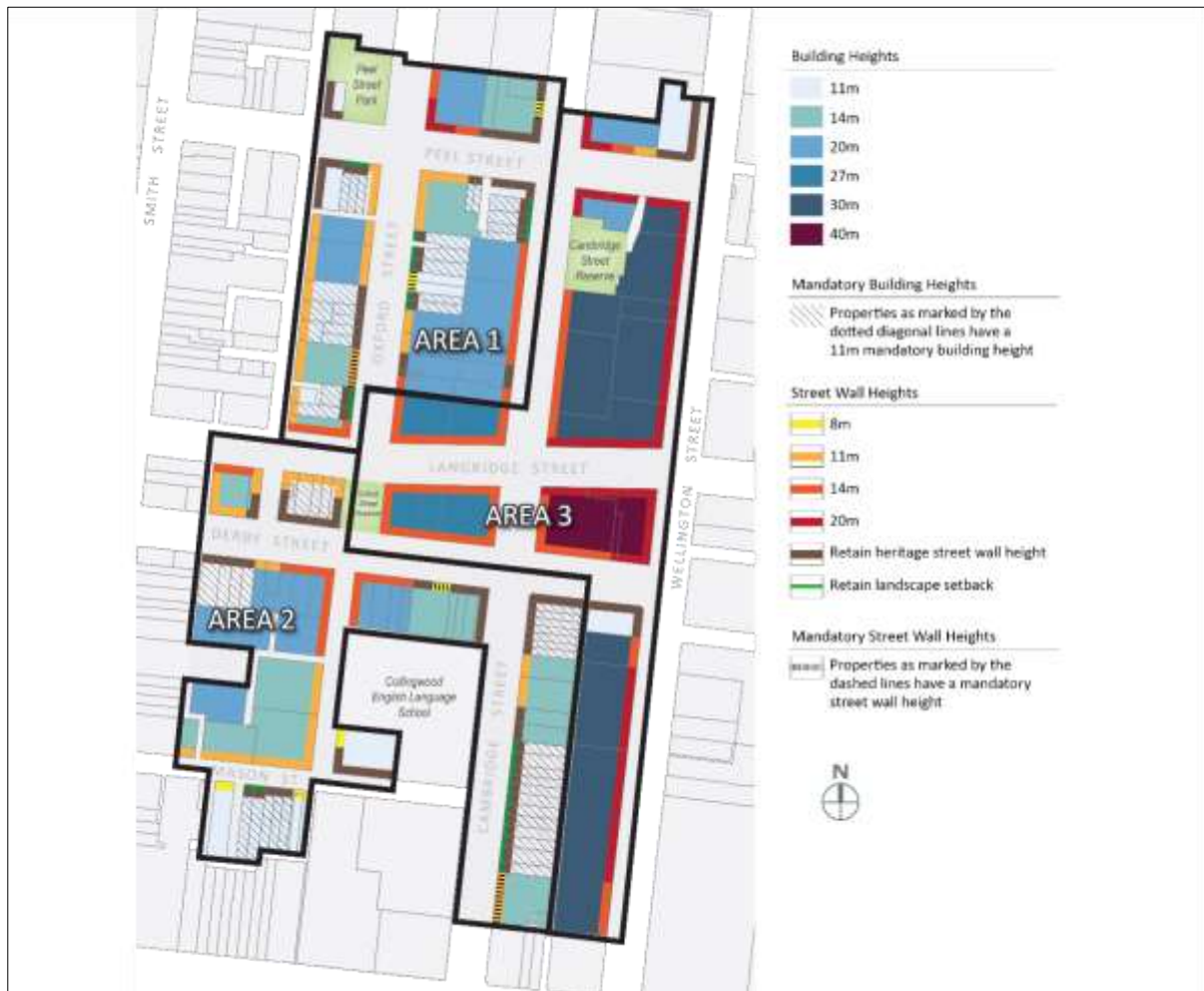
Figure 3 Exhibited DDO23 Map 1

As exhibited, Clause 2.5 (Building height requirements) states: