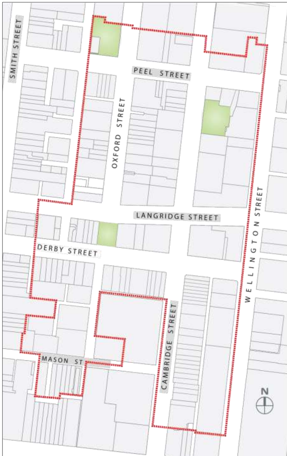
Figure 1 Subject land