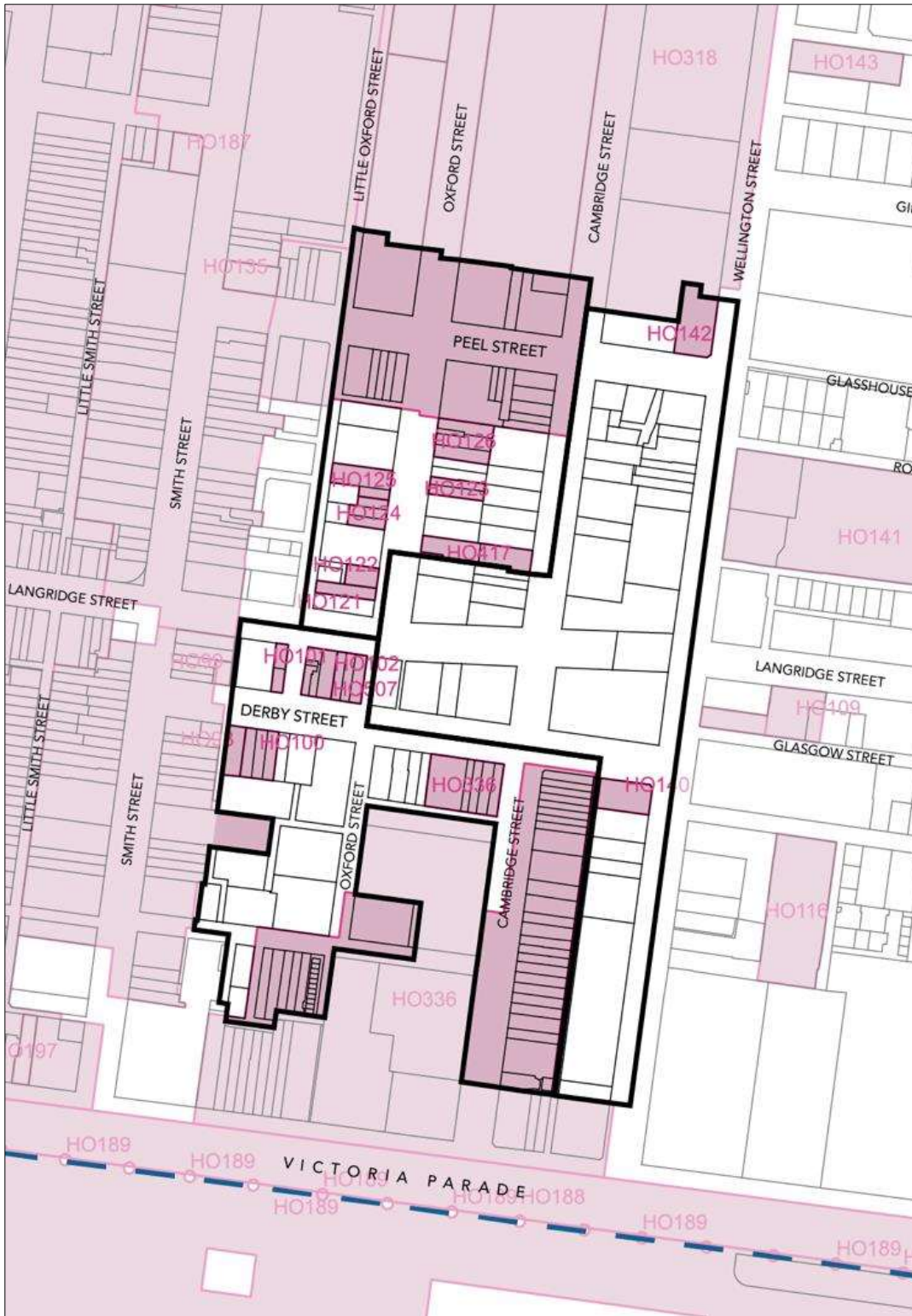
Figure 2 Location of Heritage Overlays within the Collingwood South Mixed Use Precinct