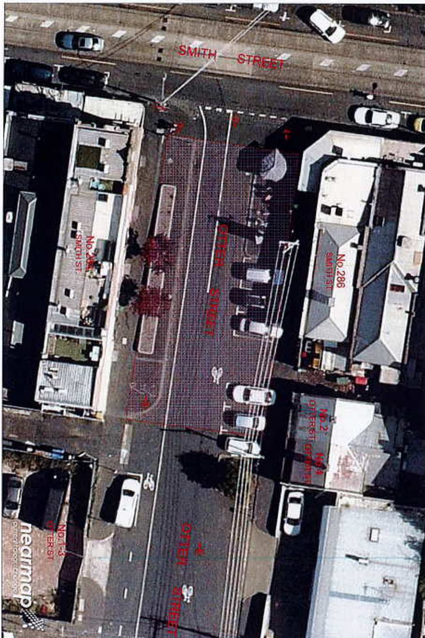
SUBJECT ROAD FOR PROPOSED DISCONTINUANCE IS SHOWN WITH PINK HATCHING ON ABOVE AERIAL PHOTO. NUMBERED PHOTO POSITIONS SHOWN IN RED