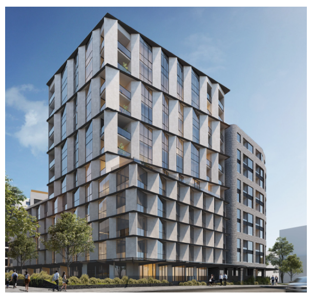
Figure 7: North-west corner view from Chandler Hwy (Building A and B)

11. Planning Permit PLN19/0841 was issued for Artisan West on 11 March 2022 at the direction of VCAT. This permit allows construction of a residential apartment development comprising four buildings ranging in height from 6 to 12 storeys containing 273 apartments and a reduction in the statutory car parking requirements. Plans have been submitted for endorsement and are currently before Council.