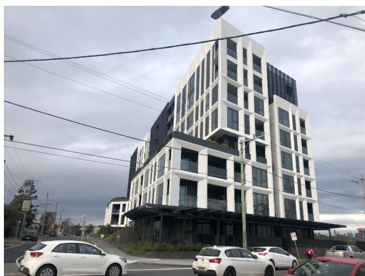
Figure 2 – 680 Heidelberg Road PLN17/0272 as constructed

4. Precinct 1B, known as 680 Heidelberg Road, contains an 8 storey residential apartment building constructed in accordance with Planning Permit PLN17/0272.