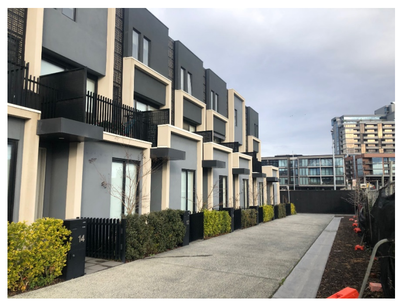
Figure 4 - Precinct 4B north-western view

6. Further to the south of Precinct 4A is Precinct 4B(North), Planning Permit PLN17/0041 was issued 23 August 2017 for demolition of an existing dwelling and construction of 74 two and three storey townhouses, plus terraces and a reduction in the car parking requirements. This precinct has been completed and is now occupied.