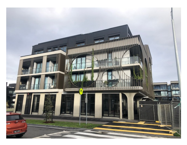
Figure 6: Artisan East Northern elevation render

11. Planning Permit PLN19/0841 was issued for Artisan West on 11 March 2022 at the direction of VCAT. This permit allows construction of a residential apartment development comprising four buildings ranging in height from 6 to 12 storeys containing 273 apartments and a reduction in the statutory car parking requirements. Plans have been submitted for endorsement and are currently before Council.