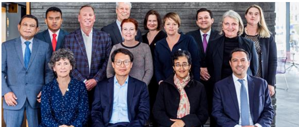
ICLEI Global Executive