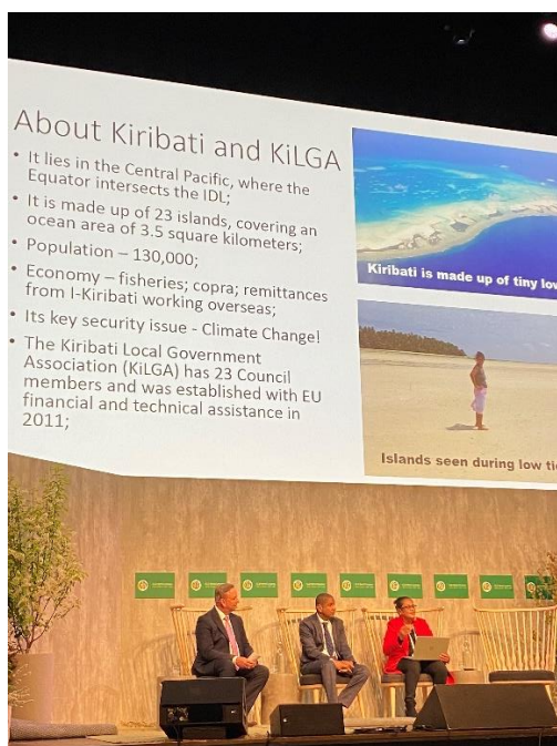
Mayor of Kiribas