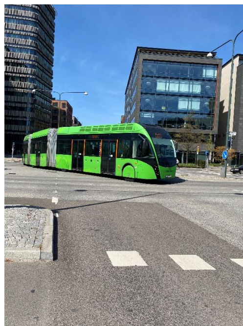
Malmö electric bus fleet