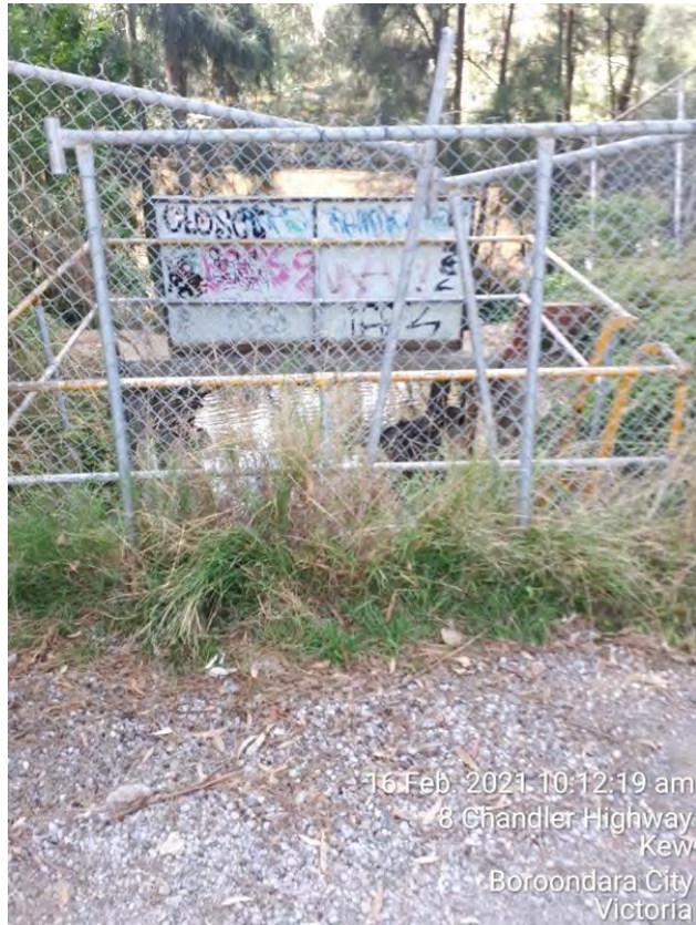
16 Feb. 2021 10:12:19 am 8 Chandler Highway Kew Boroondara City Victoria