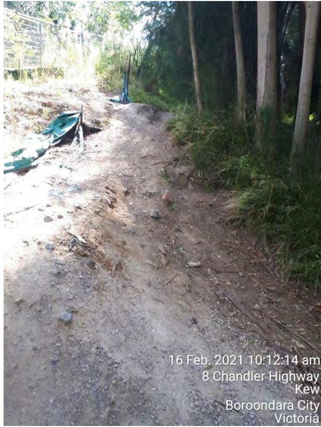
16 Feb. 2021 10:12:14 am 8 Chandler Highway Kew Boroondara City Victoria