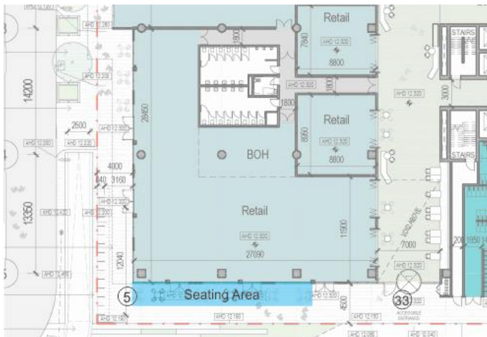
Figure 1: Proposed Outdoor Seating Area

VIPAC have reviewed MEL Consultants Report 36-20-WT-ENV-03 for the environmental wind impacts of the proposed 480 Swan Street development, Richmond. VIPAC have raised a query as to the wind conditions in the proposed outdoor seating area at the west end of the south pedestrian area as shown in Figure 1.