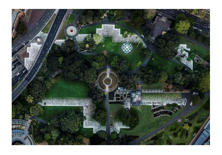
Jonathan Jones barrangal dyara (skin and bones), 2016 vast sculptural installation across 20,000 squaremetres of the Royal Botanic Garden, Sydney