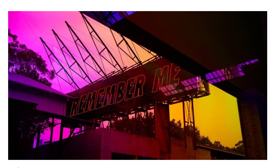
Reko Rennie Remember Me, 2020 neon 5m x 25m Carriageworks entrance, Sydney