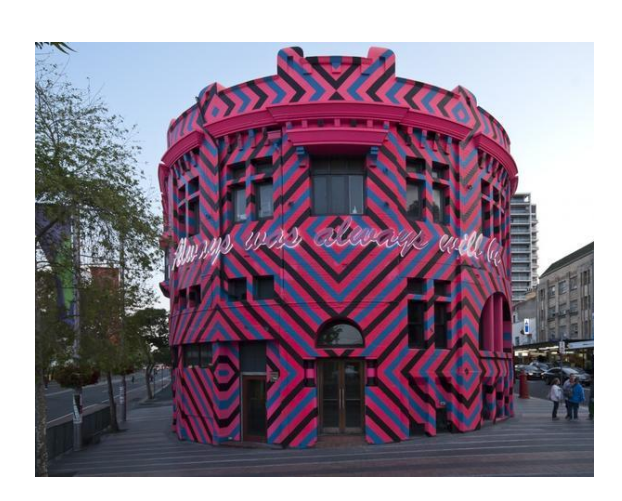
Reko Rennie Always was always will be, 2010 paint, neon Intersection with Campbell Street / Flinders Street / Oxford Street, DARLINGHURST, Sydney