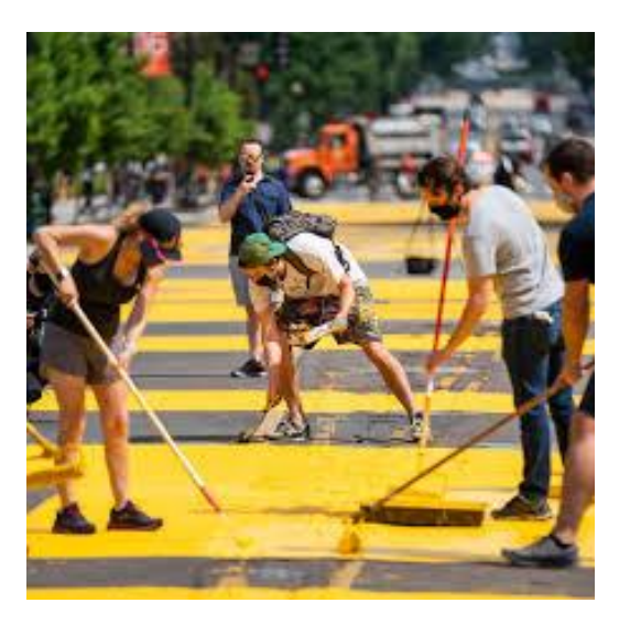
Black Lives Matter Friday, June 5, 2020 City workers and Activists 16th Street NW, Washington, D.C