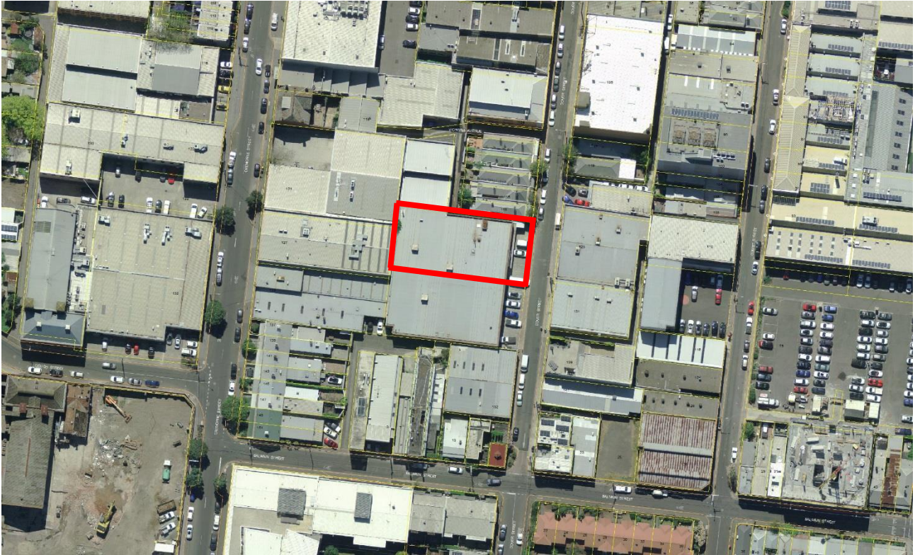
Subject site, aerial imagery, October 2018.