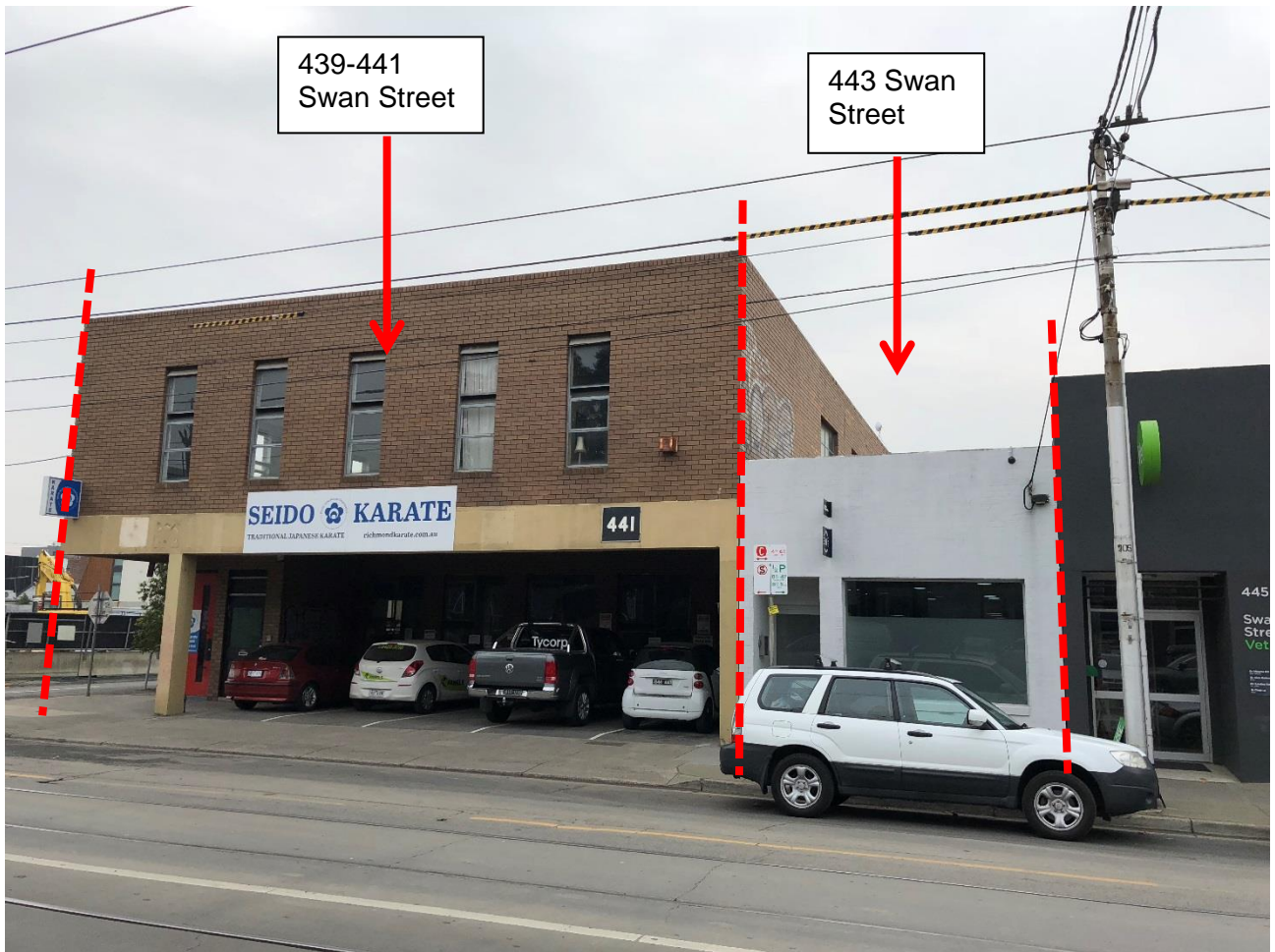
(Site photo, 28 June 2018)