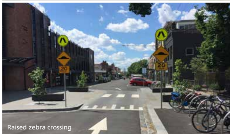
Raised zebra crossing