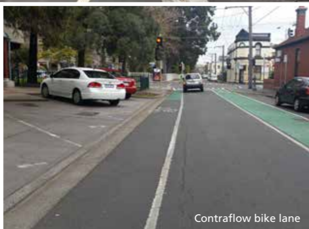
Contraflow bike lane