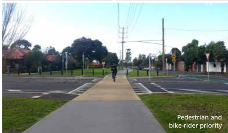
Pedestrian and bike rider priority