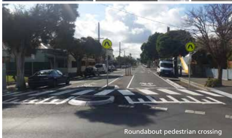
Roundabout pedestrian crossing