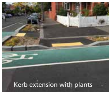
Kerb extension with plants