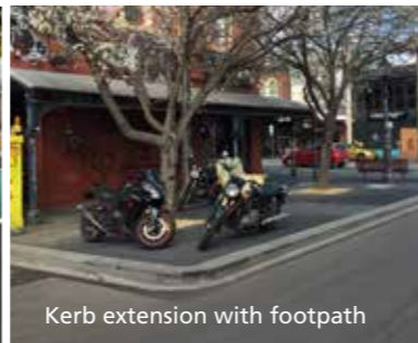
Kerb extension with footpath