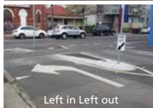
Left in Left out