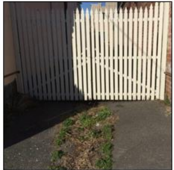
Laneways (above left and right) that that have been gated and incorporated into private property