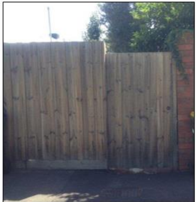
Passageways (below left and right) that that have been gated and incorporated into private property