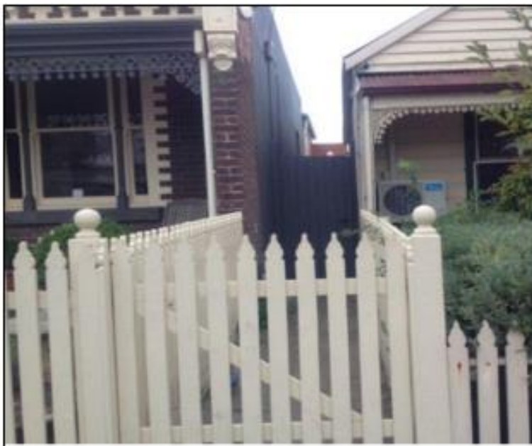
Laneway (above left) that only leads to the rear of two properties and a disused passageway (above right) that has been incorporated into private property