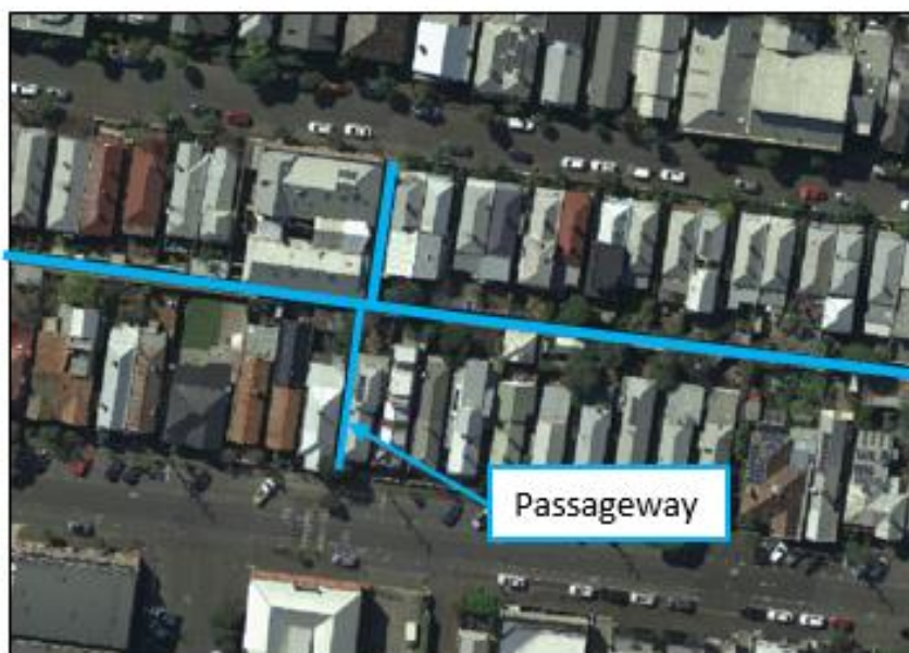
Passageway (below left) that forms part of a link between two roads (see aerial below right) that is known to be presently used on a regular basis by the public