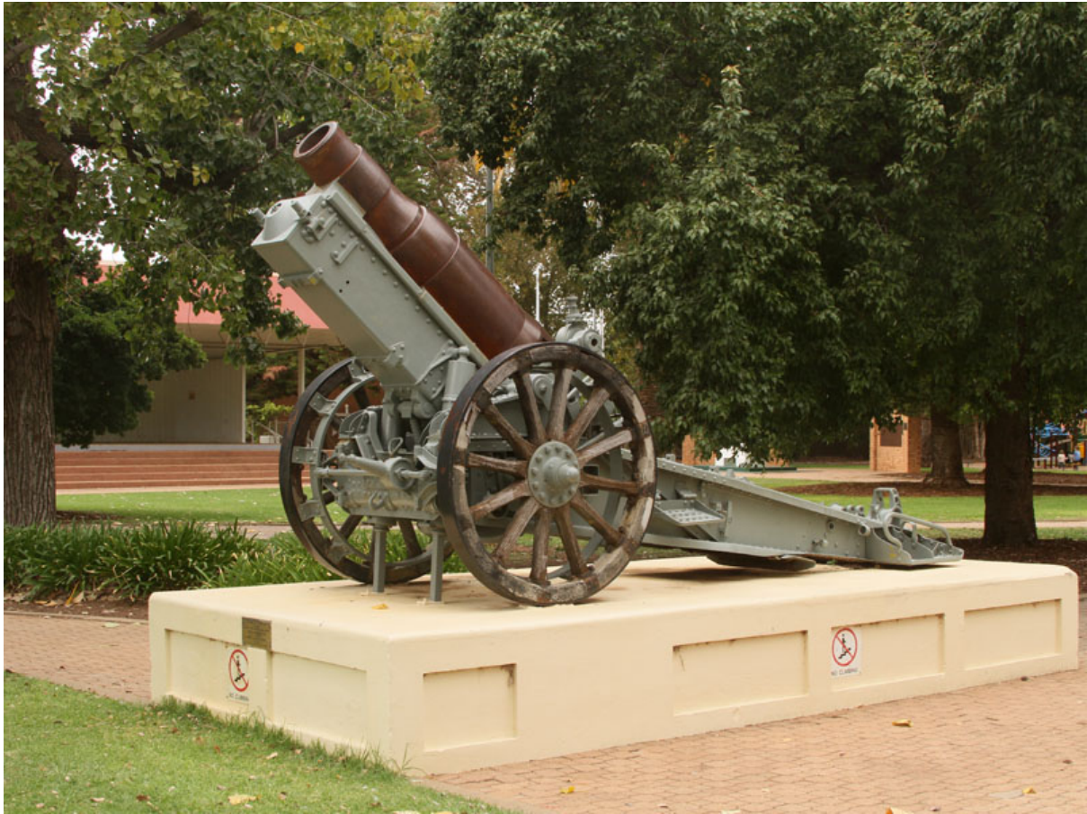
German captured Krupp Howitzer 21cm Versuchsmorser Nr 3M1907, Barclay Square, Red Cliffs, VIC.