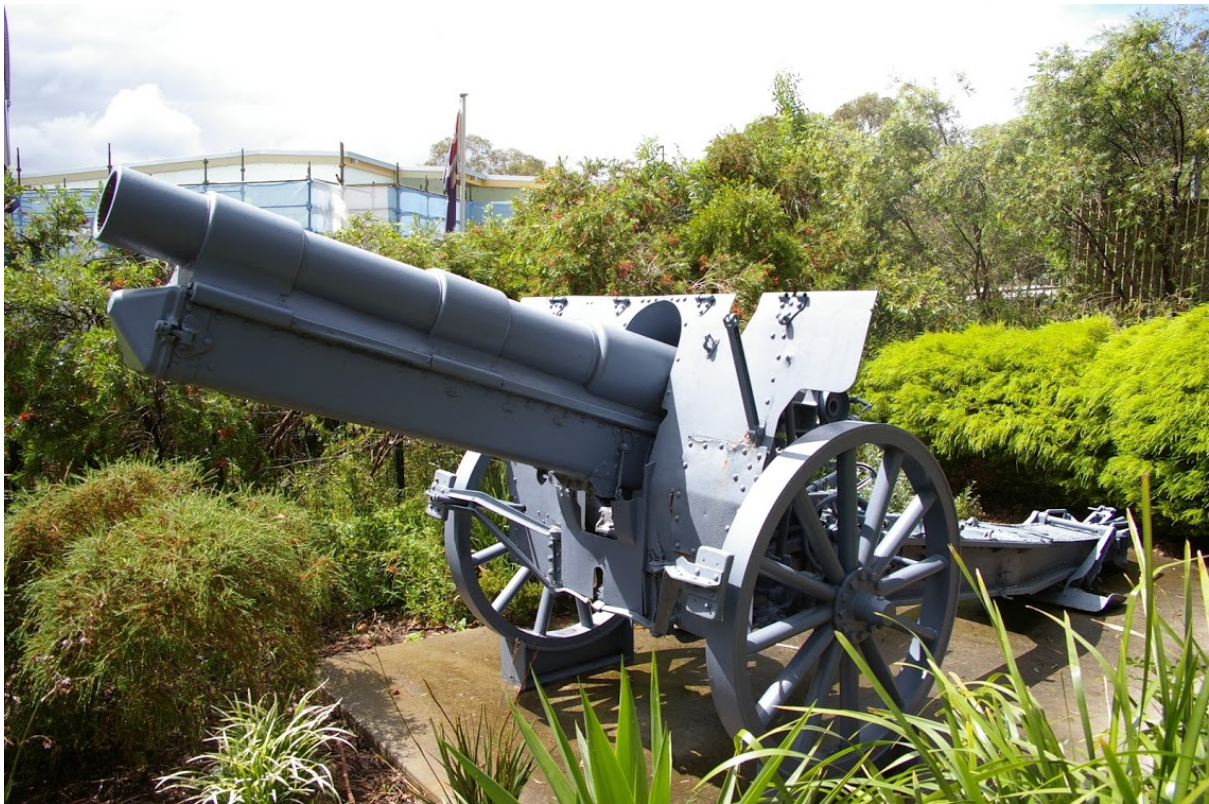
WW1 150mm Krupp Howitzer Gun installed at Montmorency RSL captured by the 22 nd AIF Battalion at the Mont St Quentin Battle in September 1918 in France. Restored through State and Federal funding and launched in 2006.