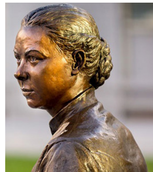
St Mary of the Cross, Australian Catholic University, St Patrick's Campus, Fitzroy

The Supper Room was the first part of the Cathedral Hall complex to be restored, with a contribution to the project from the National Institute of Youth Performing Arts. A fully restored and renovated Boot Factory, providing office and teaching space, was reopened in November 2005. In October 2007, following its restoration, Cathedral Hall was reopened. This was made possible through generous contributions from the Ian Potter Foundation and the Archdiocese of Melbourne. The Hall now provides space for lectures, with music and drama students using the Supper Room. The complex provides a focal point for the intellectual and cultural life of the University.