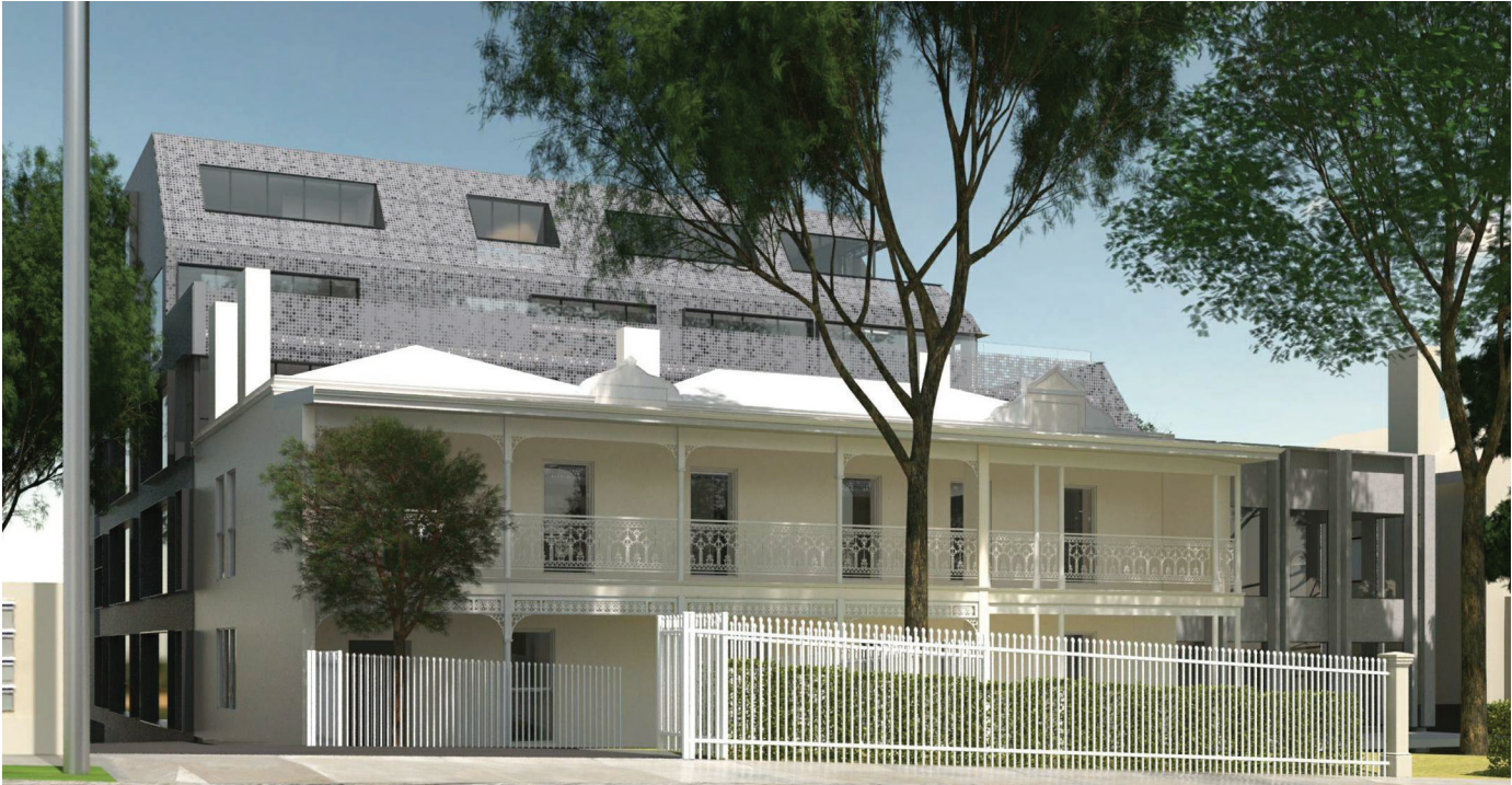
Artist impression of the proposed residential aged care facility – 351 Church Street – submitted plans – CHT Architects for Mecwacare

Yarra City Council has prepared Amendment C225 to the Yarra Planning Scheme which applies to land at 351 Church Street, Richmond.