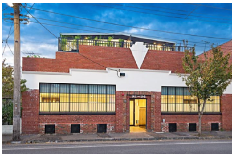
Figure 9. 92-94 Easey Street, Collingwood following the conversion to flats

Although the W. Saunders & Son Factory/Warehouse Complex was constructed during an earlier period, the 1911 building is comparable to the Easey Street factory in construction materials, the form and scale of the symmetrical façade, both with stepped parapets defined by string moulds and central entrances with flanking windows. The subject site is much grander in scale with a more dominant presence along two streets, in comparison to the more modest Easey Street factory.