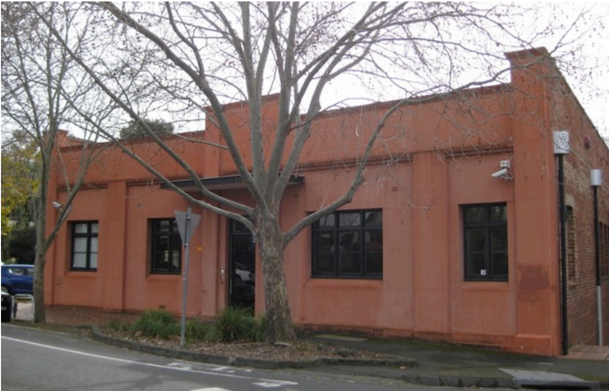
Figure 1. 20-60 Trenerry Crescent, Abbotsford: the facade of the 1911 building.