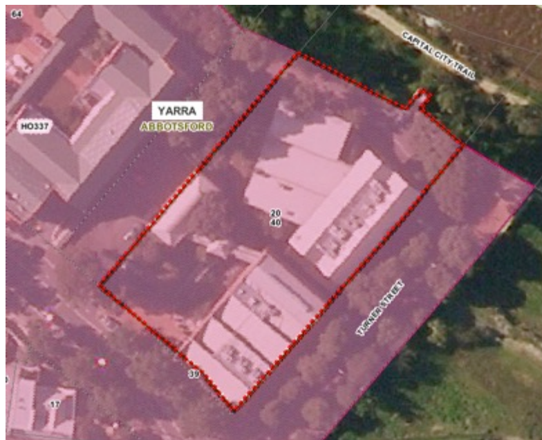
Figure 4. The subject site (red) and the existing boundary of HO337 Victoria Park Precinct (pink) (2016).