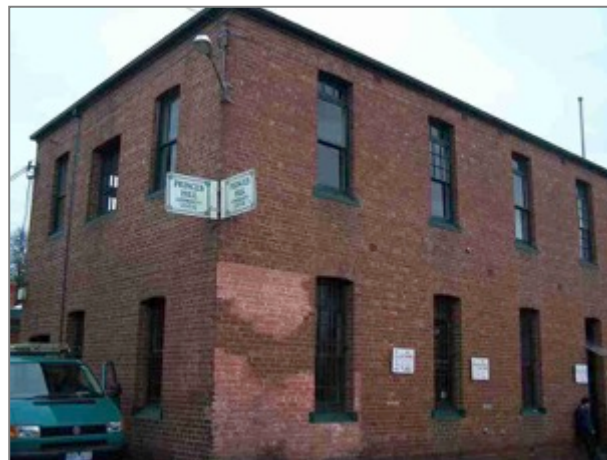
Figure 11. Rear of 16 Arnold Street, Princes Hill

This former factory, constructed between 1900 and 1915, is a two-storey, face-brick construction with a hipped roof, addressing two streets. It retains a high level of integrity. The factory occupies a similar footprint to the 1911 building at the W. Saunders & Son Factory/Warehouse Complex. While their roof forms differ, they are comparable in terms of the unadorned red-brick elevations with repetitive rows of single window placement. The W. Saunders & Son Factory/Warehouse Complex building has more elaborate architectural treatment and detail to the façade in comparison, but is less intact due to alterations to the windows and sills.