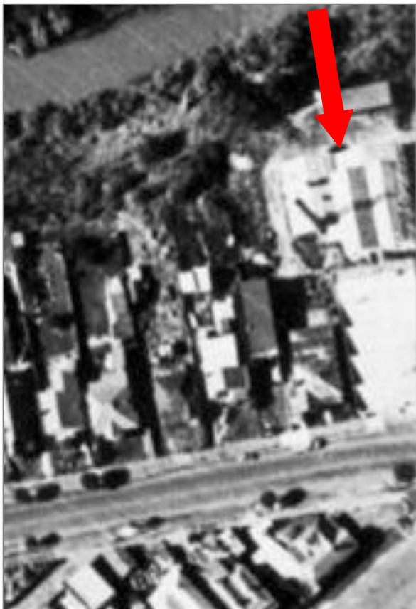
Figure 6. A detail of a 1966 aerial of Trenerry Crescent, showing the subject site.