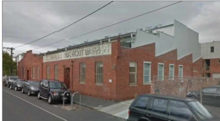
Figure 10. 40 Reid Street, Fitzroy North (@Google)

The W. Saunders & Son Factory/Warehouse Complex is a similar red-brick construction and has a comparable application of architectural treatment, albeit in a slightly different expression. The subject site retains a higher degree of integrity as it retains its original profile and roof form.