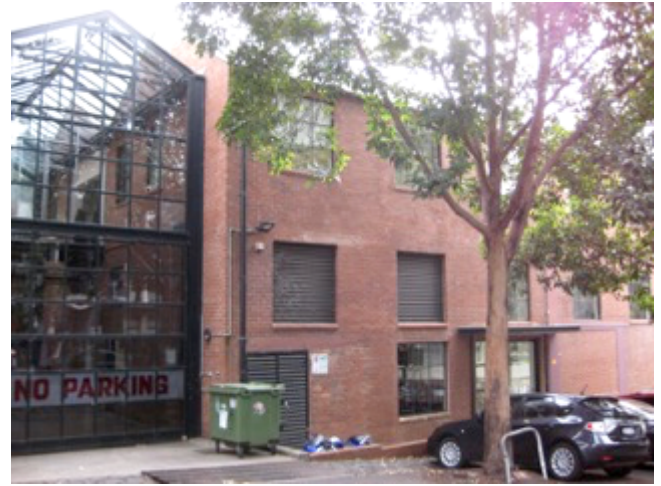
Figure 3. The 1920s factory building (right) and 1984 two-storey glazed structure that links the 1920s and 1911 buildings.