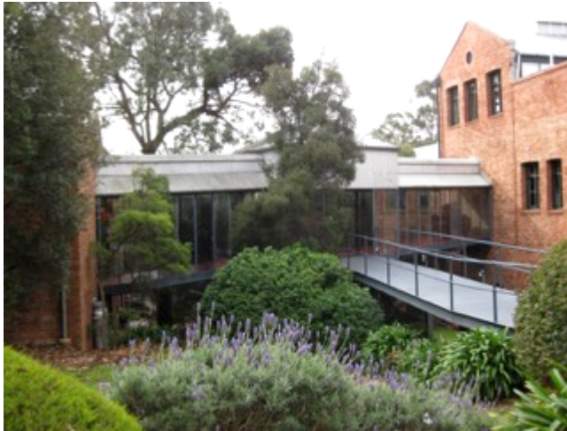
Figure 2. The north-west elevation of the 1911 building (right) with its gabled third-storey, the 1984 glazed walkway and the modified 1920s brick office building (left).