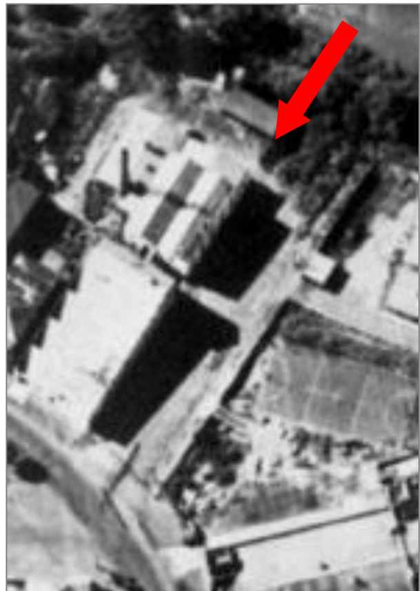
Figure 7. Detail of a second 1966 aerial of Trenerry Crescent and Yarra Falls.

This place is associated with the following themes from the City of Yarra Heritage Review Thematic History (July 1998):