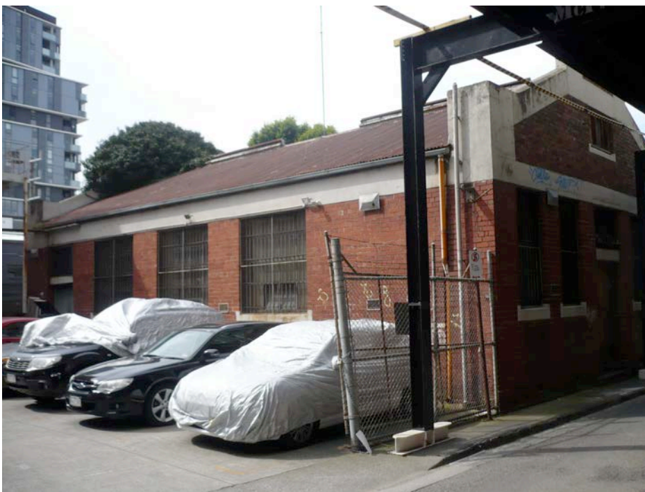
Figure 3: The 1920/30s building on the part of 14 Glasgow Street that is outside of HO109. The HO109 boundary appears to coincide with the boundary between the car park and the building.