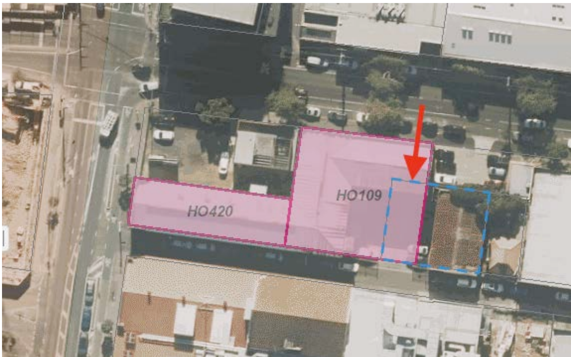
Figure 1: Shows the existing HO boundaries in relation to 14 Glasgow Street, which is indicated by the dotted blue line. The red arrow indicates the section of the c.1937 William Peatt building that appears to be within 14 Glasgow Street.

As shown in Figure 1, part of 14 Glasgow Street is included within HO109, which is one of two individual heritage overlays that apply to the former William Peatt Boot Factory complex, constructed in stages from 1895 to c.1937.