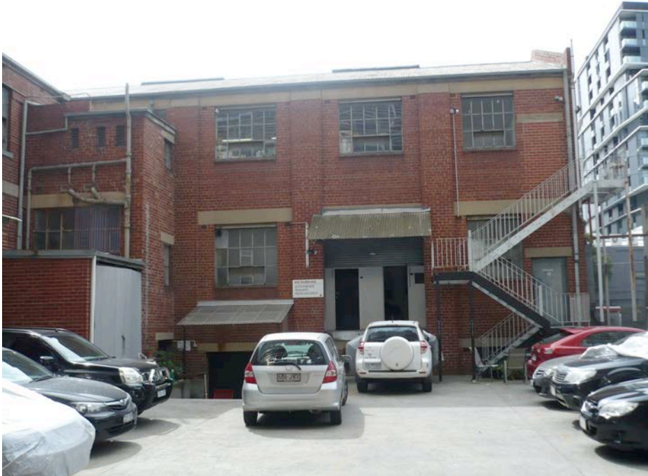
Figure 3: The section of the car park to the right of this photo forms part of 14 Glasgow Street that is within HO109

HO109. 61-75 Langridge Street is the site immediately to the east that is partially vacant or contains modern warehouse buildings.